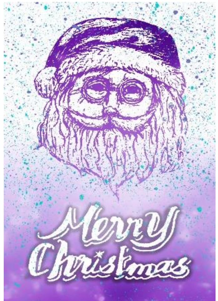
Sarum Academy Christmas Card 2022