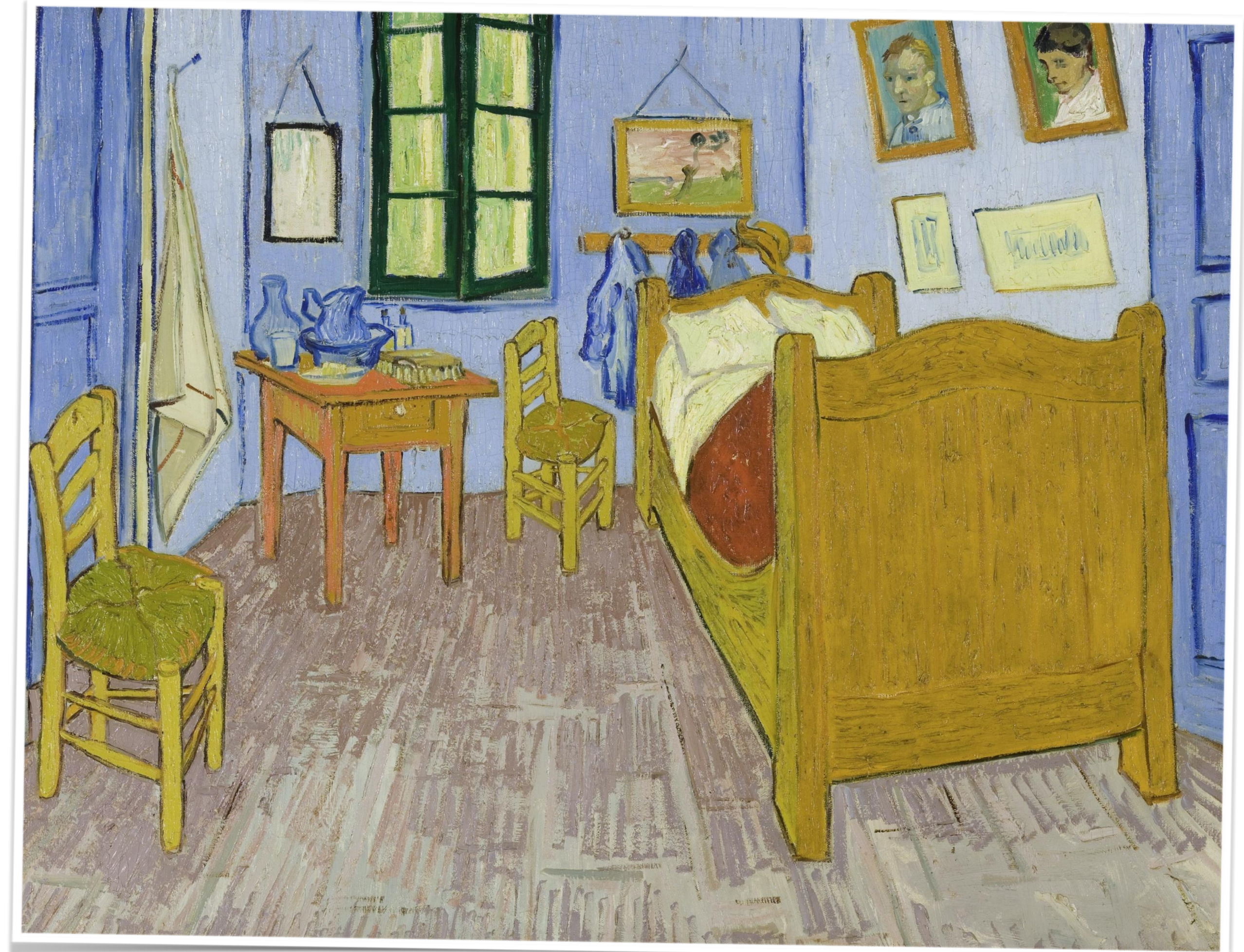
Van Gogh - Bedroom 1888