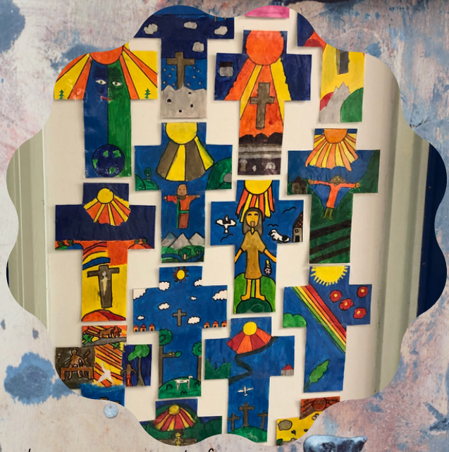
El Salvador crosses as part of Easter celebrations at BSJ