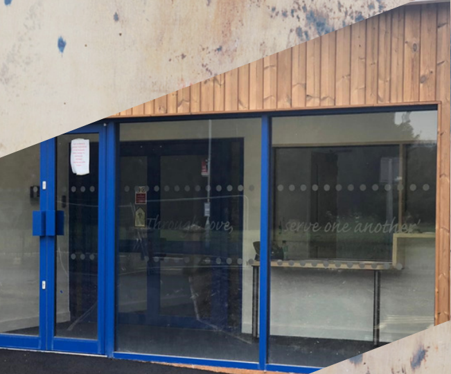
New school entrance at Bemerton St John