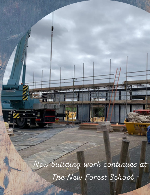
New building work continues at The New Forest School